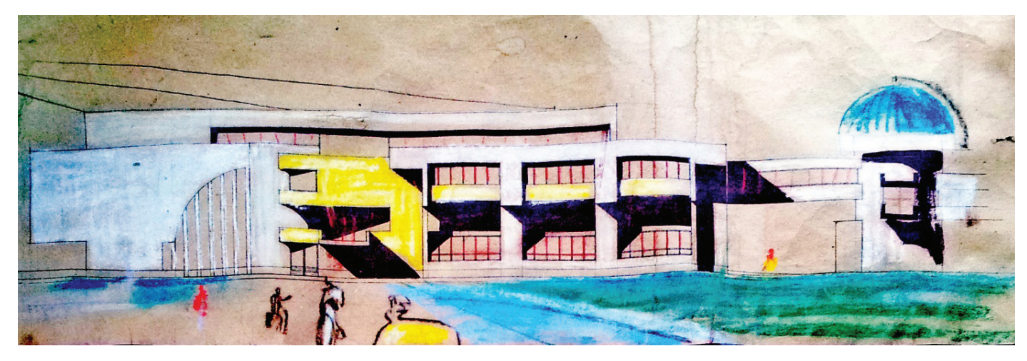
Fig. 6. Former youth centre, now a primary school, Virbališkės Takas 4, 1985, architects Gintautas Petras Likša and Irena Likšienė, a sketch of the South façade.

architecture. At present they are managed by the local municipality, maintain their initial function, are in good physical state, and have retained initial qualities of space and volume structure, use of materials, environment and purpose.