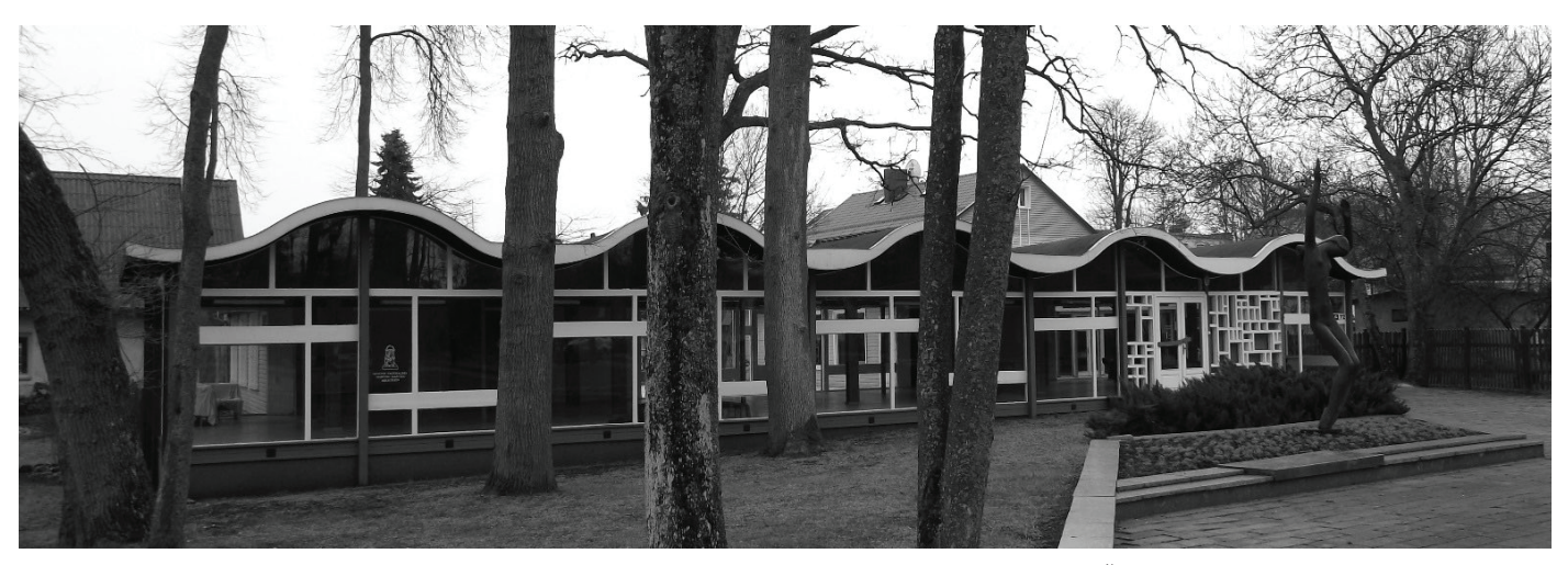
Fig. 3. Summer reading pavilion of the National Martynas Mažvydas Library, Vytauto g. 72, 1965, architect Albinas Čepys.

Liutauras Nekrošius, Edita Riaubienė, Palanga's Modern Architecture on the Way to Heritage