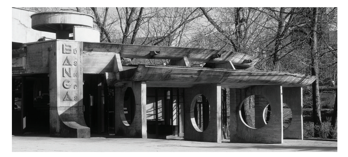
Fig. 8. Coffee shop pavilion "Banga", J. Basanavičiaus g. 2, 1976–1979, demolished in 2015, architect Gintautas J. Telksnys [Photo: Arūnas Baltėnas, 2005, source: Navickienė E., Vaitys L., Karpavičius E. Architektas Gintautas Telksnys. Vilnius: Artseria, 2005].

critical-regionalist rest-home by the National Academy of Science, now "Cuprum" apartment house, S. Daukanto g. 15, 1982, architect Vytautas Dičius and Leonidas P. Ziberkas), demolished (example of the original concrete plastics, coffee shop pavilion "Banga", J. Basanavičiaus g. 2, 1976–1979, demolished in 2015, architect Gintautas J. Telksnys Fig. 8), or are abandoned (e.g. follower of Habitat'67 – rest-house "Guboja", Jūros g. 65A, 1976, architect Rimantas Buivydas, Fig. 9). There is little probability that within the context of the on-going reconstructions traditional acts for enrolment on the List could somehow contribute to the conservation of values of the only functionalist new town – Vanagupė resort (architects A. Lėckas, Saulius Šarkinas, and Leonidas Merkinas).