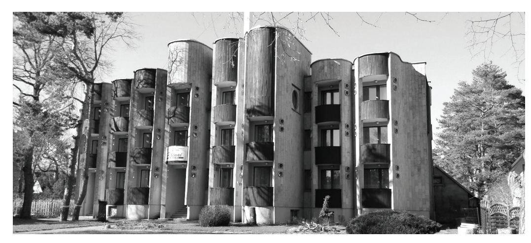
Fig. 7. Rest-house "Pilėnai", Birutės al. 23, architect Vikis Juršys.