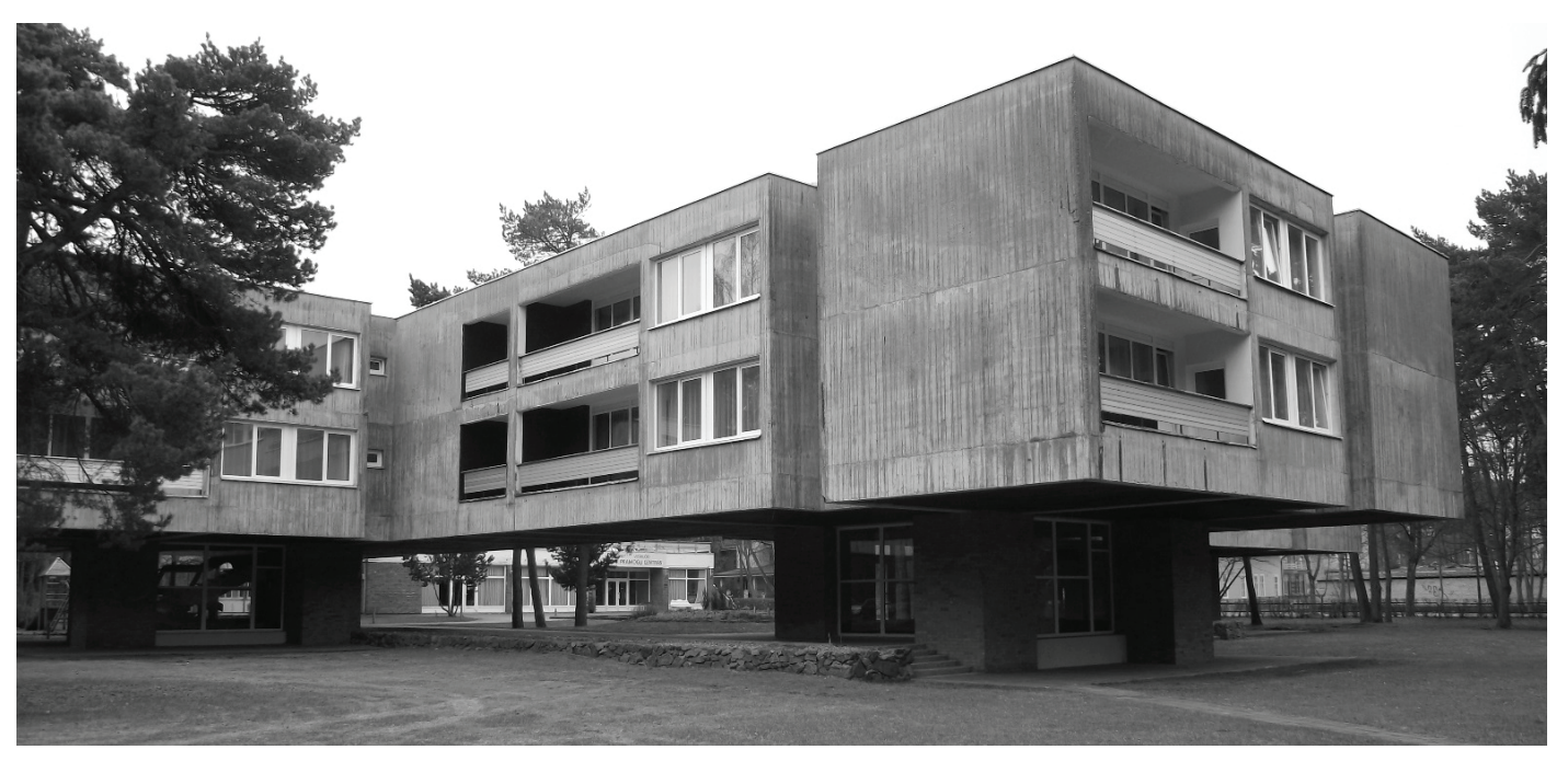
Fig. 1. Rest-house "Žilvinas", Kęstučio g. 34, 1968, architect Algimantas Leckas.