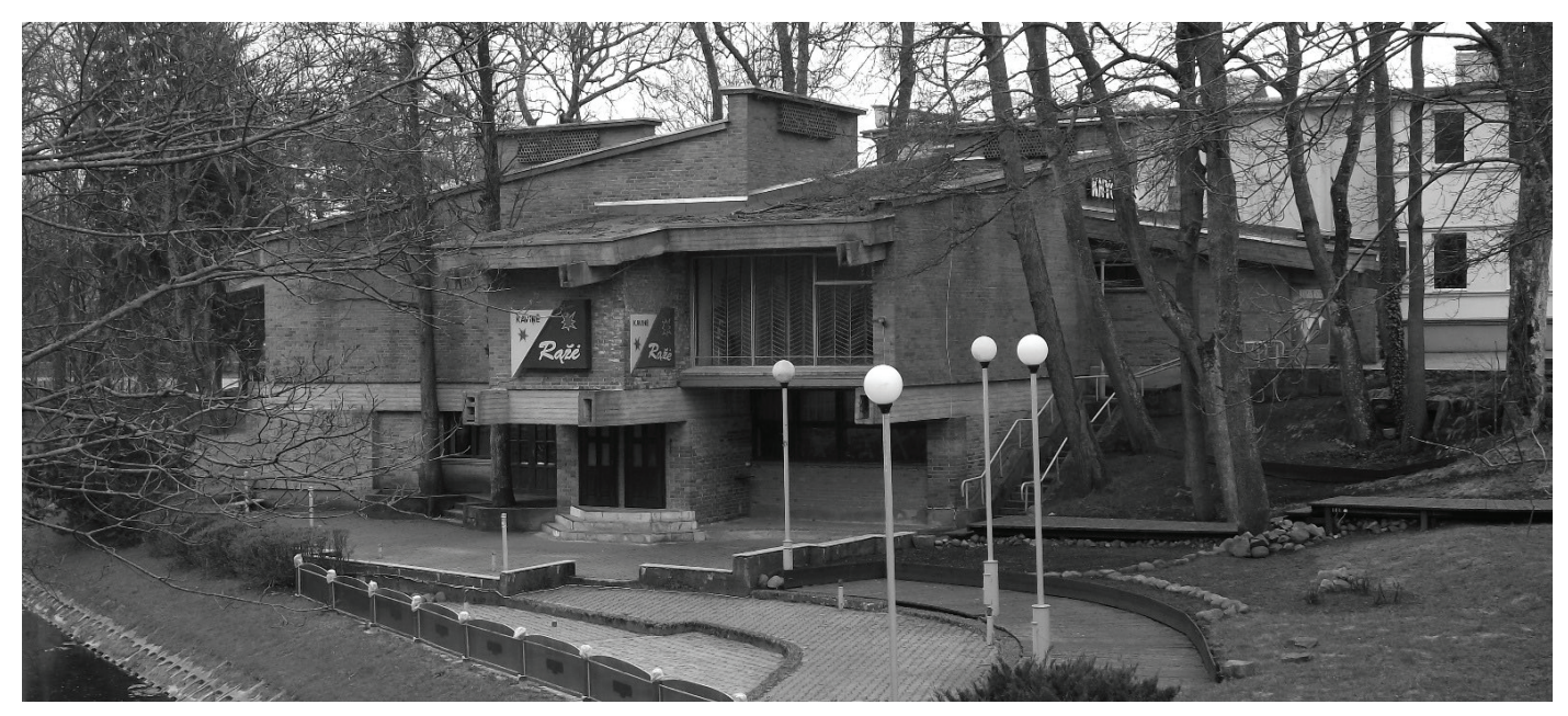
Fig. 4. Bookshop and café "Rążė" pavilion, Vytauto g. 84, 1967, architect Ramūnas V. Kraniauskas.

material by local carpenter Juozas Auželis, contrasted the processes of construction industrialisation and building standardisation of those times, but was well-timed with ideas of regionalism. It is important to mention another project by the same architect – exhibition pavilion (Simono Daukanto g. 24) – which was build using timber collected in woods after hurricane in 1968. When the competition for new construction on this site was held in 2009, the majority of the participants (4 of 5 mentioned projects) were in favour of preservation of the pavilion. An important role in the town's architectural identity plays another pavilion, which is a fascinating example of critical regionalism – the building of