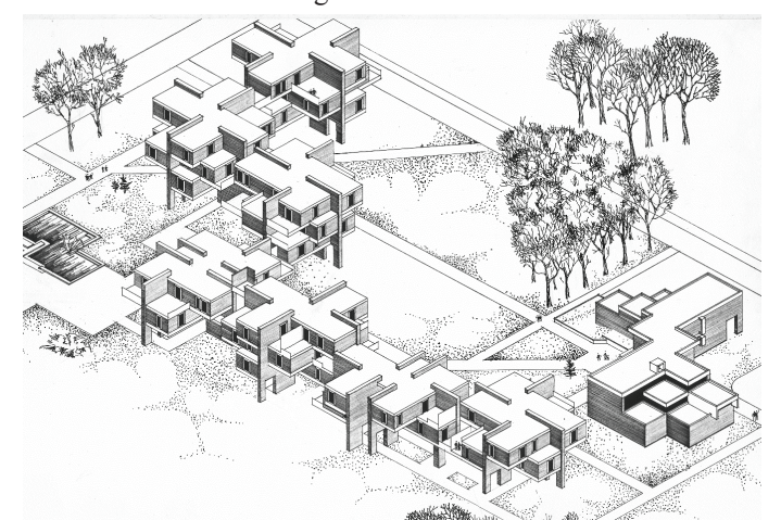
Fig. 9. Rest-house "Guboja", Jūros g. 65A, 1976, architect Rimantas Buivydas, axonometry.

However, an expert assessment for the successful heritage protection is important but insufficient. Community understanding, cognition, identification, and recognition is essential. We must strive for inclusive heritage.