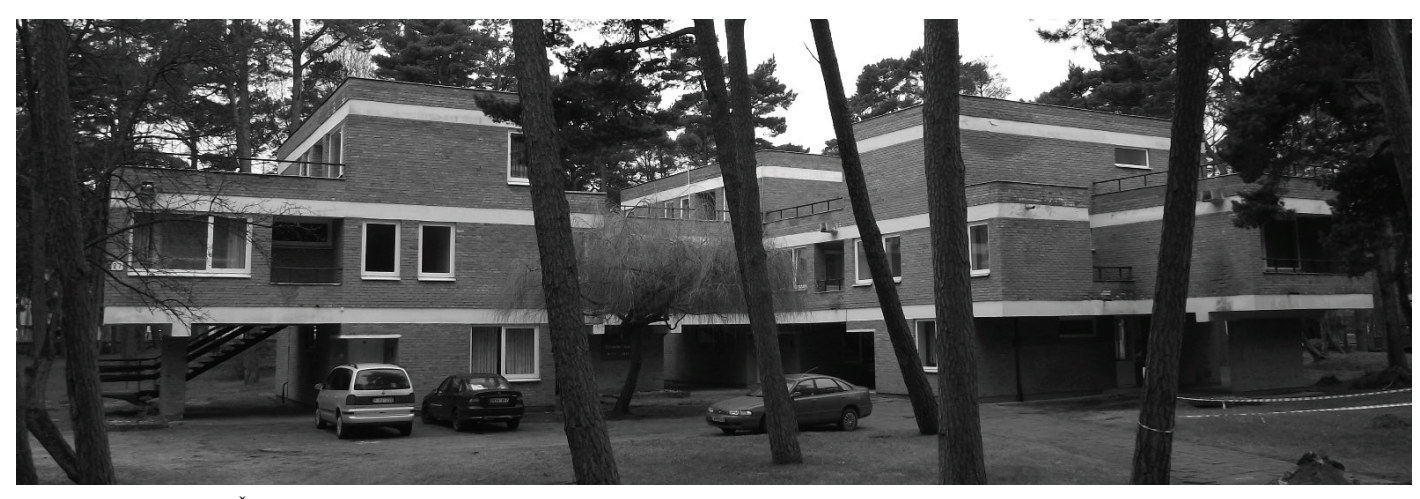
Fig. 2. Apartment house "Žilvinėlis", Birutės al. 44, 1970, architect Algimantas Leckas.

half of the 20th century – namely, by 16 villas, 17 residential houses, two hotels, a pharmacy, spa building, ship rescue station, bus station, manor homestead, school, two churches and four chapels. Two the most prominent examples of the 2nd half of the 20th century have been taken into protection in recent years.